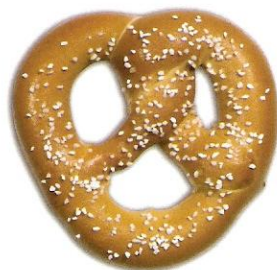
Pretzel Kit Item #40300