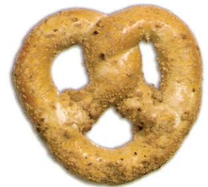
Apple Pie Stuffed Pretzel Item # 40320