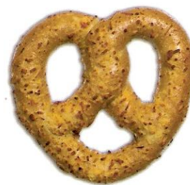
Grilled Cheese Stuffed Pretzel Item # 40310