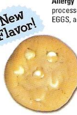
Lemon Cooler item # 44060