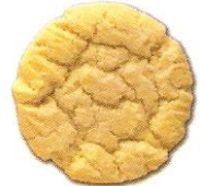
Sugar Cookie item # 44087