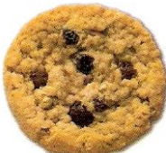
Oatmeal Raisin item # 44086