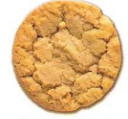
Peanut Butter item # 44088