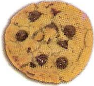
Chocolate Chip item # 44080