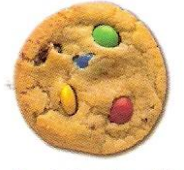
Candy Cookie with m&m's® Candies item # 44090