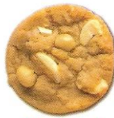
White Chunk Macadamia Nut item # 44097