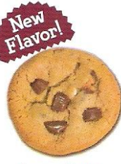
Peanut Butter Cup Cookie item # 44090