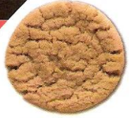
Snickerdoodle item # 44005