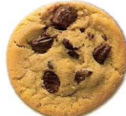
Chocolate Chunk item # 44082