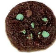
Chocolate Mint Chip item # 44045