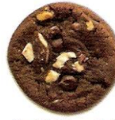
Double Chocolate Brownie item # 44049